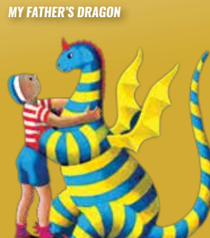
MY FATHER'S DRAGON