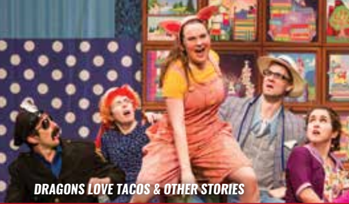
DRAGONS LOVE TACOS & OTHER STORIES