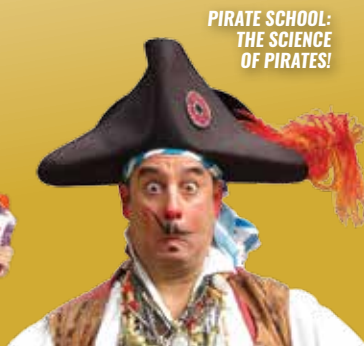
PIRATE SCHOOL: THE SCIENCE OF PIRATES!