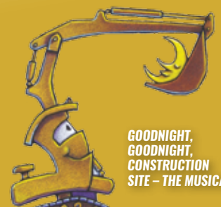
GOODNIGHT, GOODNIGHT, CONSTRUCTION SITE - THE MUSICAL