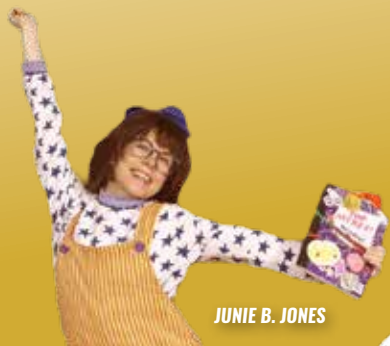
JUNIE B. JONES

Bedtime is approaching, and this construction team needs its rest... but Crane is getting cranky, Cement Mixer takes too long with bathtime, and Dump Truck just isn't sleepy! Will they get some shut-eye in time for tomorrow's work? Don't miss a world premiere musical based on the bestselling book. Recommended for grades pre K-3 in connection with the FCPS language arts curriculum.