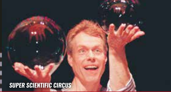
SUPER SCIENTIFIC CIRCUS